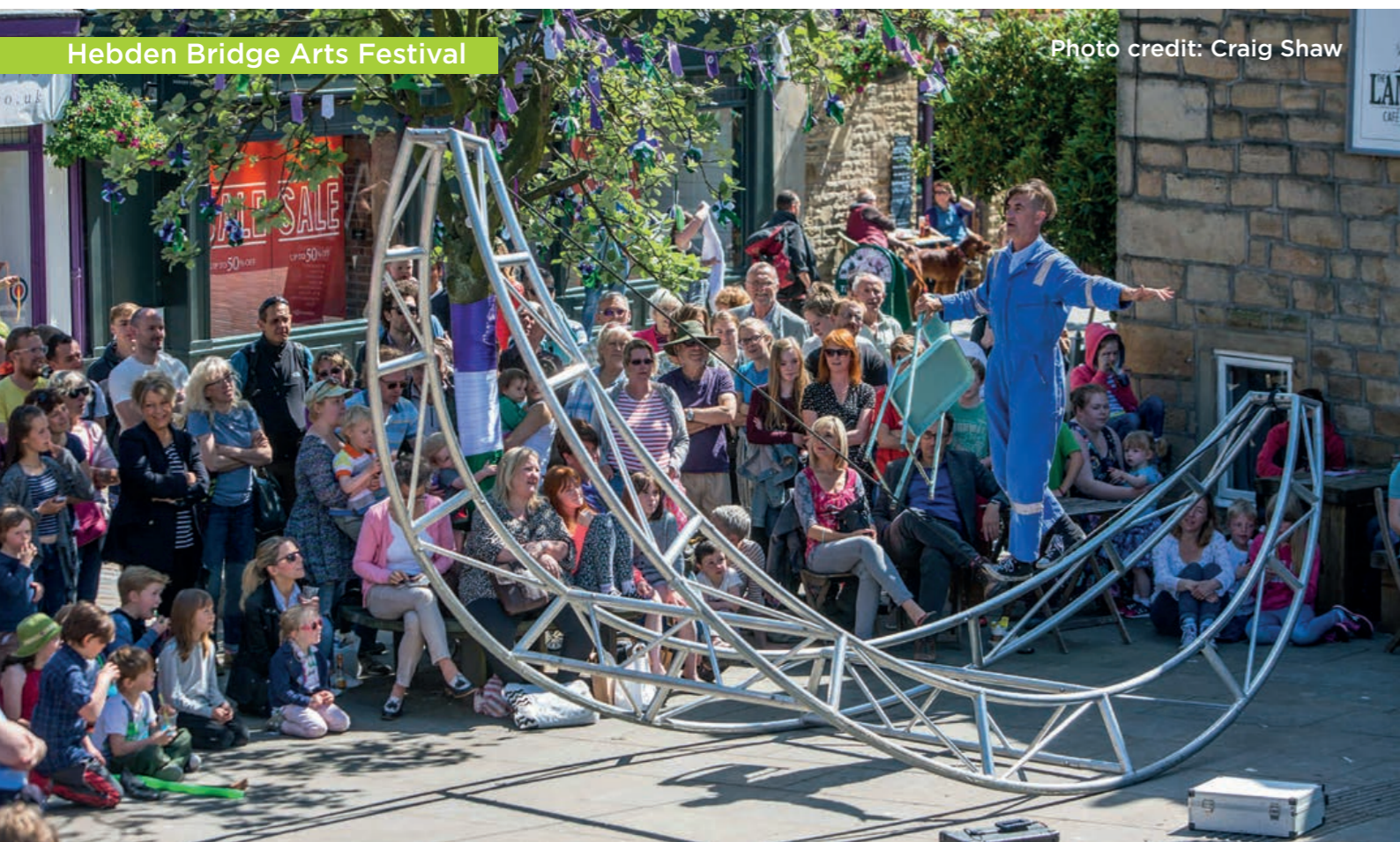
Hebdon Bridge Arts Festival

There is much debate nationally about the future sustainability of our high streets, and the need to evolve them to be more 'experience driven', giving shoppers and visitors more leisure, social and cultural activities to enjoy and participate in. If our high streets are to develop in this way, investment in events and festivals will be an important component of creating that experience.