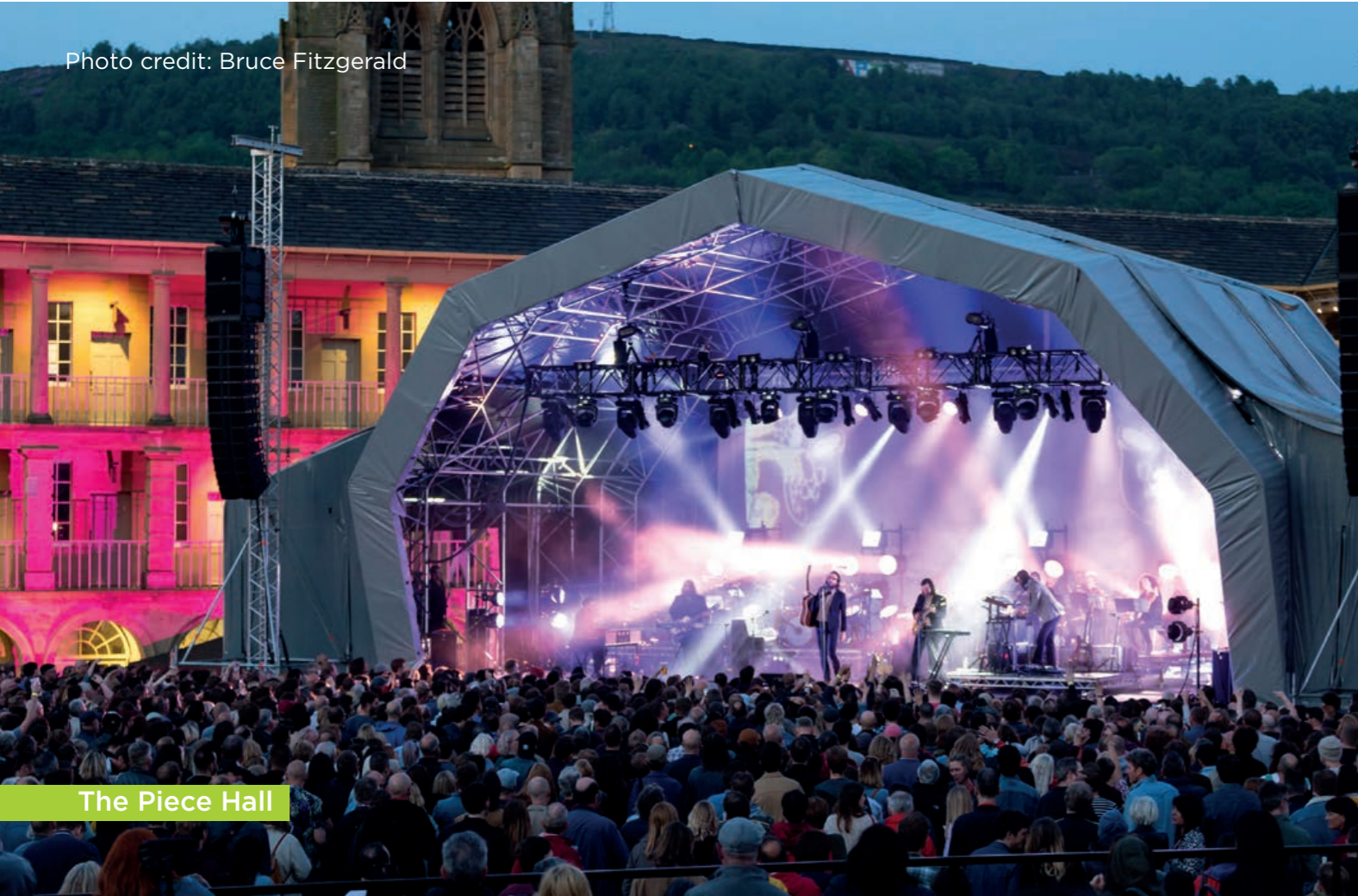
The Piece Hall

The Piece Hall hit the 2 million visitor mark in summer 2018 on the anniversary of its reopening. Visitors keen to experience the independent retail, food and drink and creative events programme. Throughout 2019 more than 125 days of events are programmed and expected to attract 440,000 visitors to a combination of ticketed and free events.