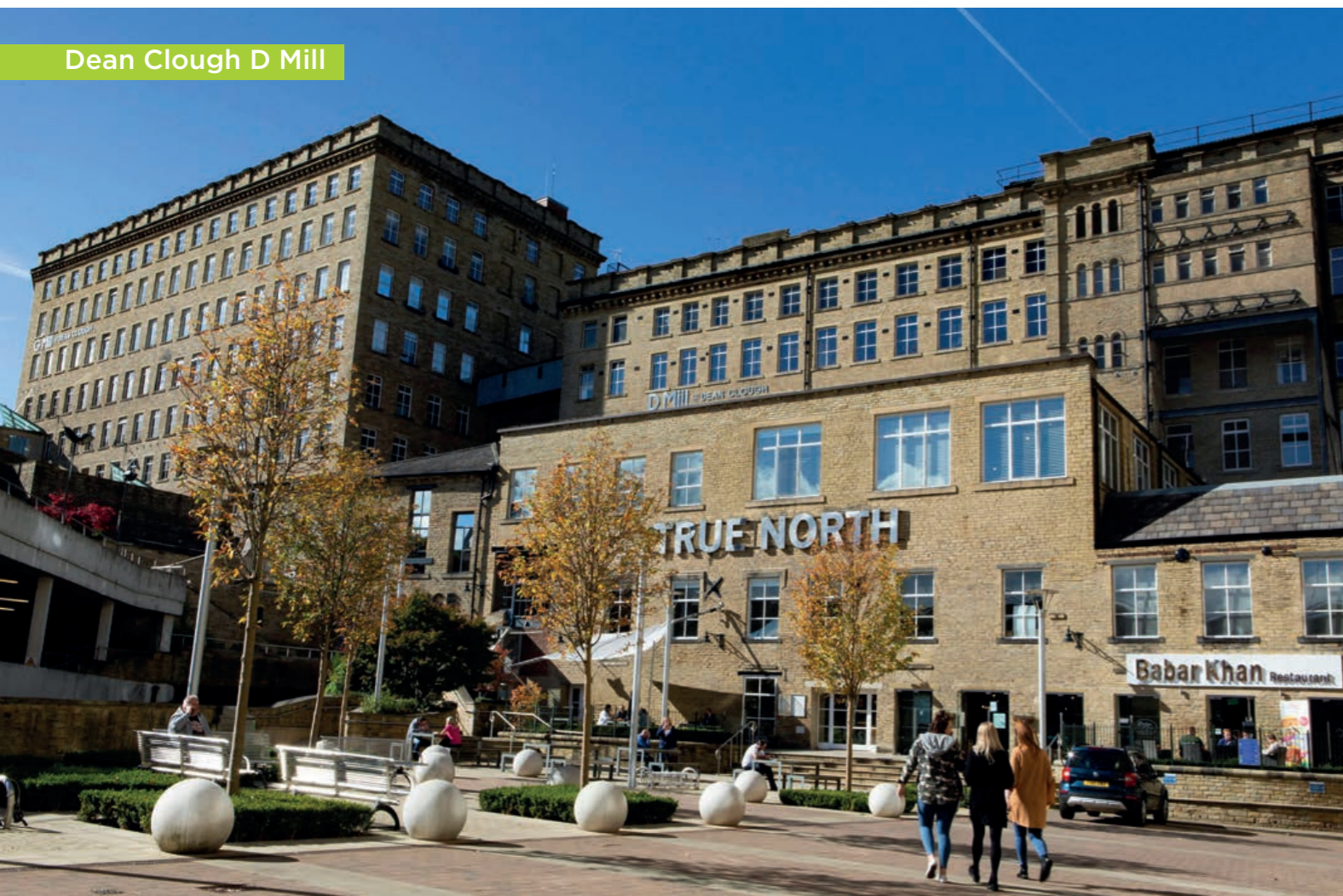
Dean Clough D Mill

educational establishments and schools is needed. Time, planning and resource must be dedicated if skills development and retention within the tourism sector is to be achieved. Led by strong, sustainable businesses, success will be measured in terms of business growth and local job creation.